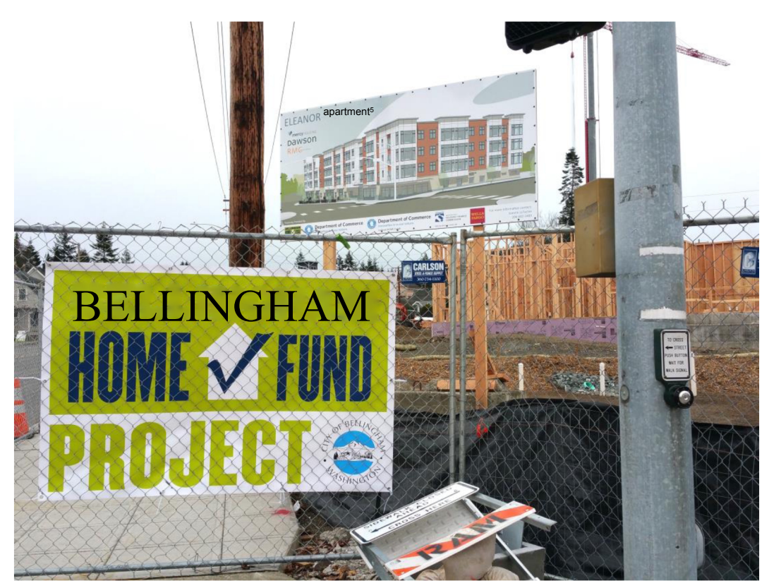
On Ellis St, new dense and affordable apartments are being built for low-income seniors. Good for the climate, good for people.